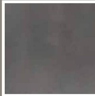
Dark Charcoal Metallic